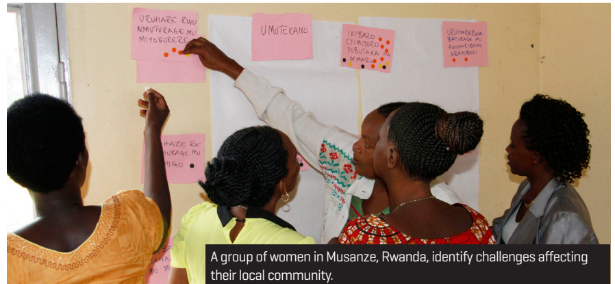
A group of women in Musanze, Rwanda, identify challenges affecting their local community.

Gender analysis helps to highlight specific needs and priorities for men and women to inform policies, programs and budgets. It also helps to remedy gender-based inequalities and to meet the needs of different populations. Still,