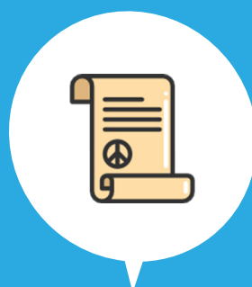
Research & Advocacy