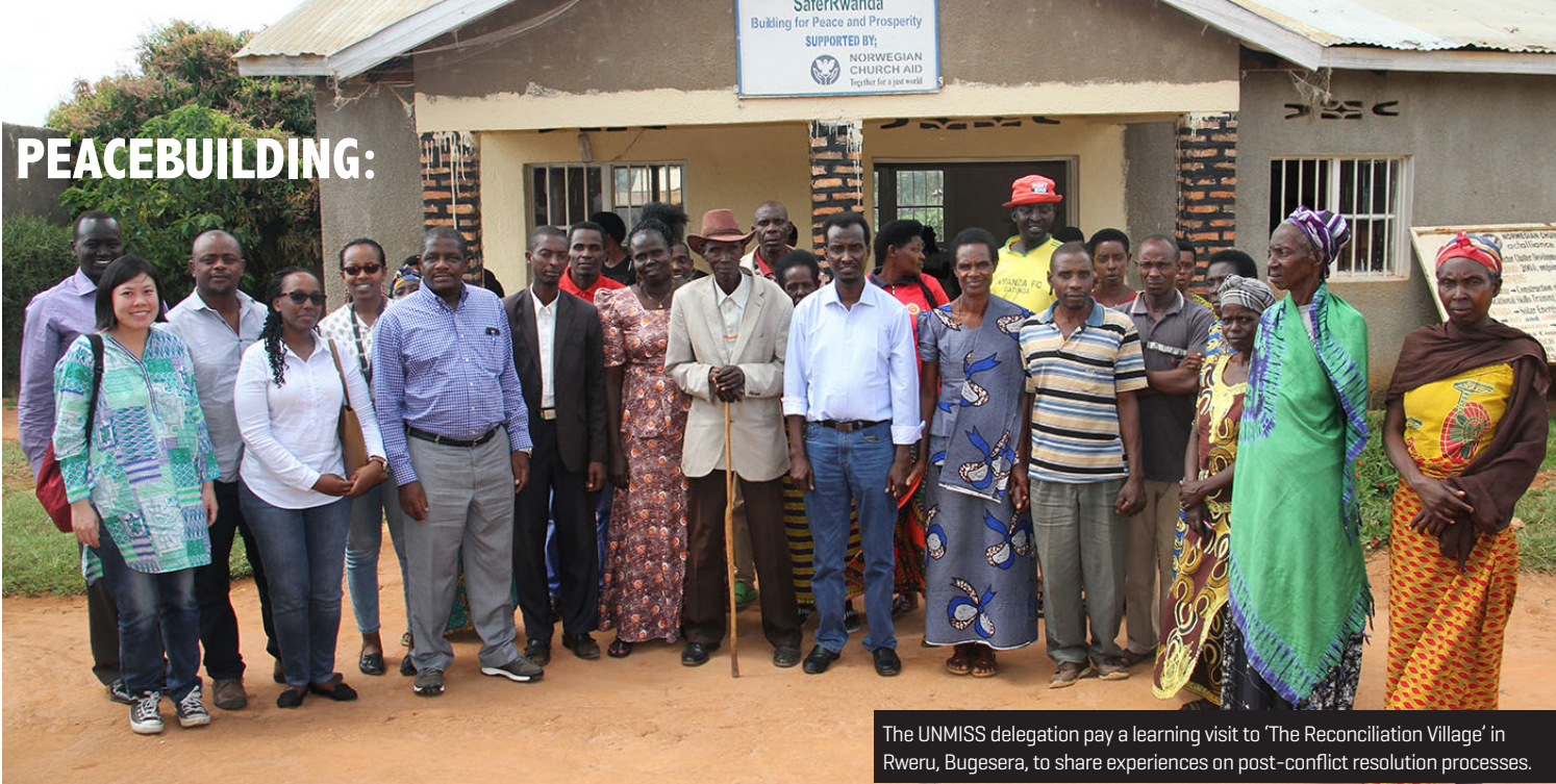
The UNMISS delegation pay a learning visit to 'The Reconciliation Village' in Rweru, Bugesera, to share experiences on post-conflict resolution processes.