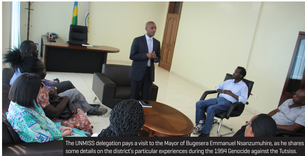
The UNMISS delegation pays a visit to the Mayor of Bugesera Emmanuel Nsanzumuhire, as he shares some details on the district's particular experiences during the 1994 Genocide against the Tutsis.

Under the conflict resolution mechanism theme, there was a presentation about 'Practical conflict resolution mechanisms