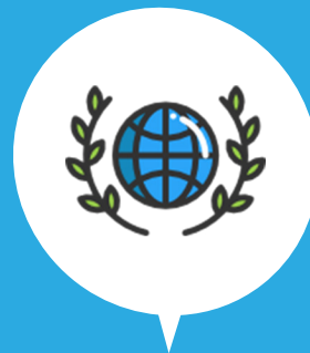
Governance & Rights