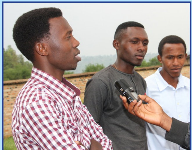
Inzira Nziza participants being interviewed by local radio stations on their various succesful initiatives after the training sessions.