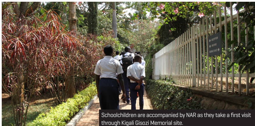
Schoolchildren are accompanied by NAR as they take a first visit through Kigali Gisozi Memorial site.

Both aspects of healing and governance are interlinked. If you think about it, can a wounded person lead others; can a wounded society constructively engage with their leaders? Both