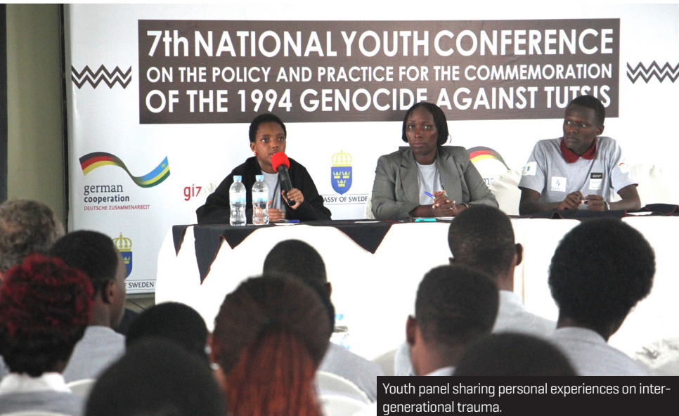
Youth panel sharing personal experiences on inter-generational trauma.