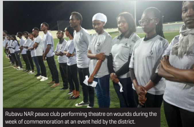
Rubavu NAR peace club performing theatre on wounds during the week of commemoration at an event held by the district.