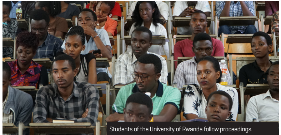
Students of the University of Rwanda follow proceedings.

Among these approaches is the recent Peace Building Seminar that was convened at the University of Rwanda – Huye campus, in collaboration with the Clinical Psychology Students Association of Rwanda (CPSAR), under the theme “The Relevance of Psychology in Peace Building”. CPSAR, a student-led association focused on clarifying common misconceptions about mental health, used this as an opportunity to raise awareness on the issues surrounding mental health and how psychological approaches are