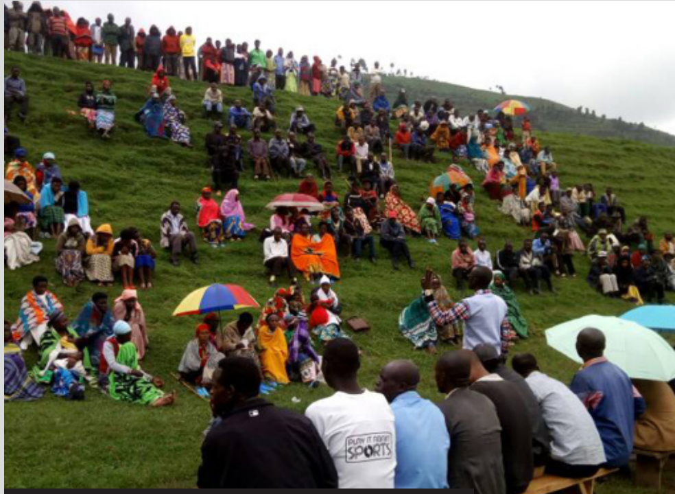
Nyabihu NAR peace club participating in discussions during the week of commemoration that centred around understanding the country's history.

The youth peace clubs have used some of the lessons they have learned from their interactions with Never Again Rwanda, to contribute to the ongoing discussions in a variety of ways. Some youth clubs have taken members to directly participate in the discussions, while others have used the participatory theatre approach, to express their testimonies of reflection to communities. The youth in these clubs have recognised the importance of commemoration, so as to continue to lend a hand to a healing nation that needs the full support of its young population.