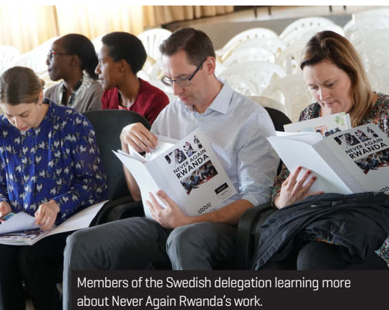
Members of the Swedish delegation learning more about Never Again Rwanda's work.

Read full version on: www.neveragainrwanda.org