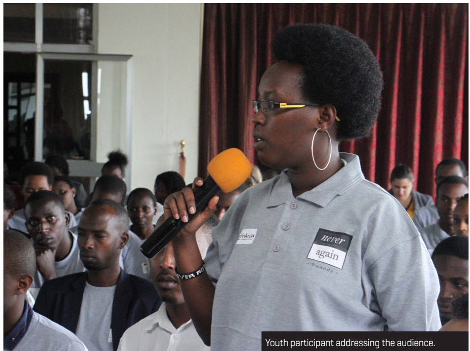
Youth participant addressing the audience.

Read full version on: www.neveragainrwanda.org