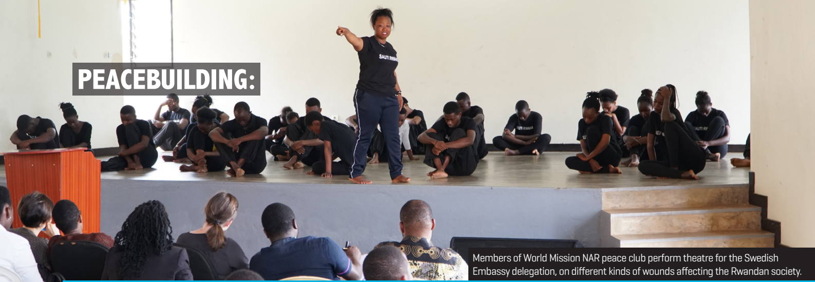
Members of World Mission NAR peace club perform theatre for the Swedish Embassy delegation, on different kinds of wounds affecting the Rwandan society.