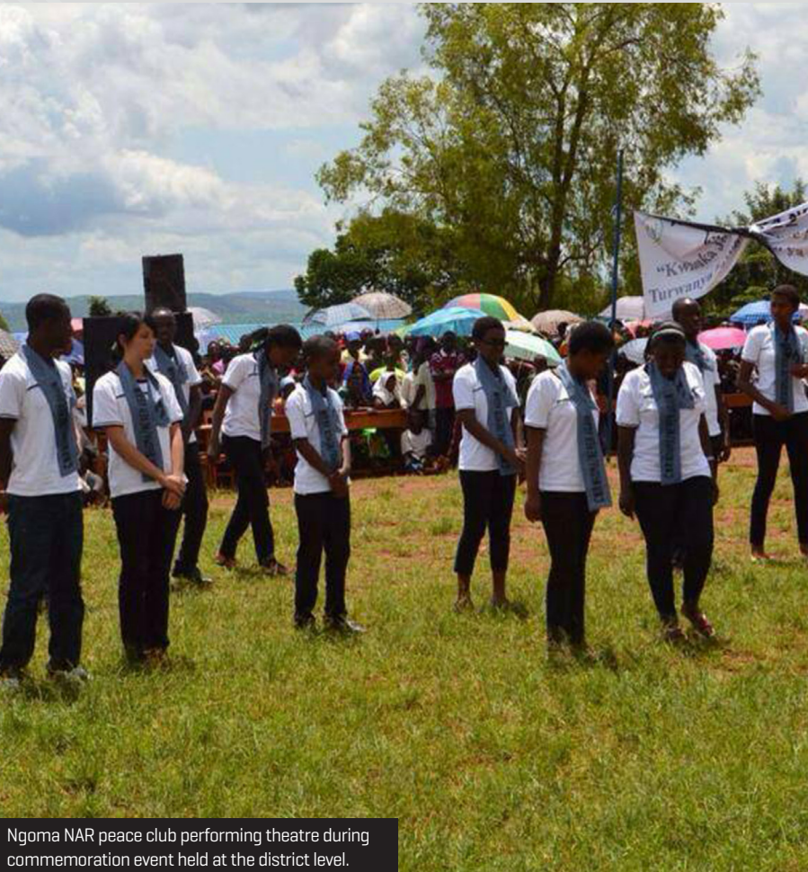
Ngoma NAR peace club performing theatre during commemoration event held at the district level.