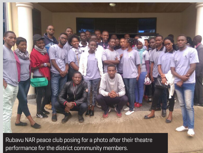
Rubavu NAR peace club posing for a photo after their theatre performance for the district community members.