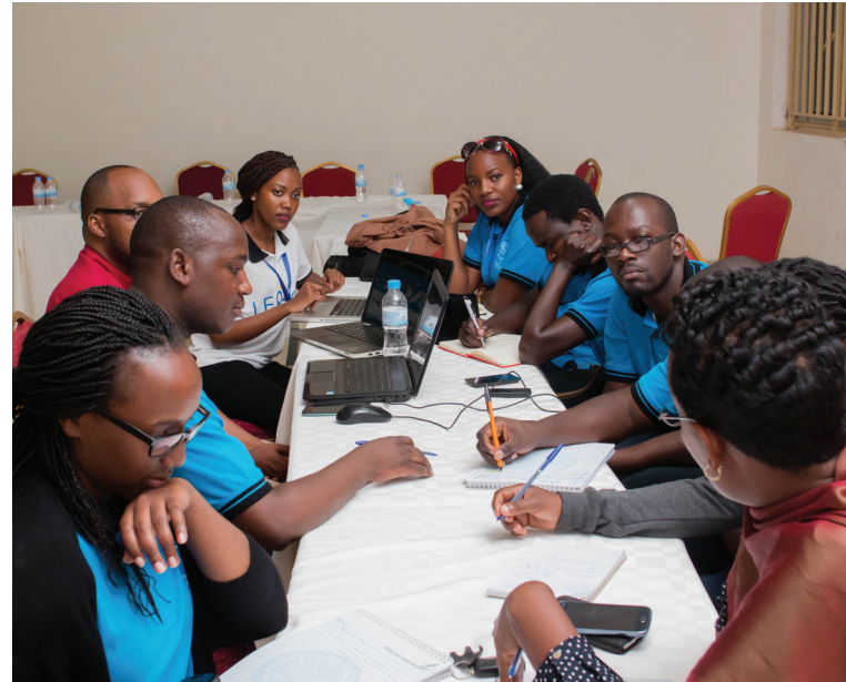
PBI ALUMNI IN A DISCUSSION: PBI communications team going through the day’s tasks

We believe in a holistic approach where we don’t only provide participants with information but receive feedback and engage in discussions on various concepts. In order to make participants experiences memorable we will integrate a wide