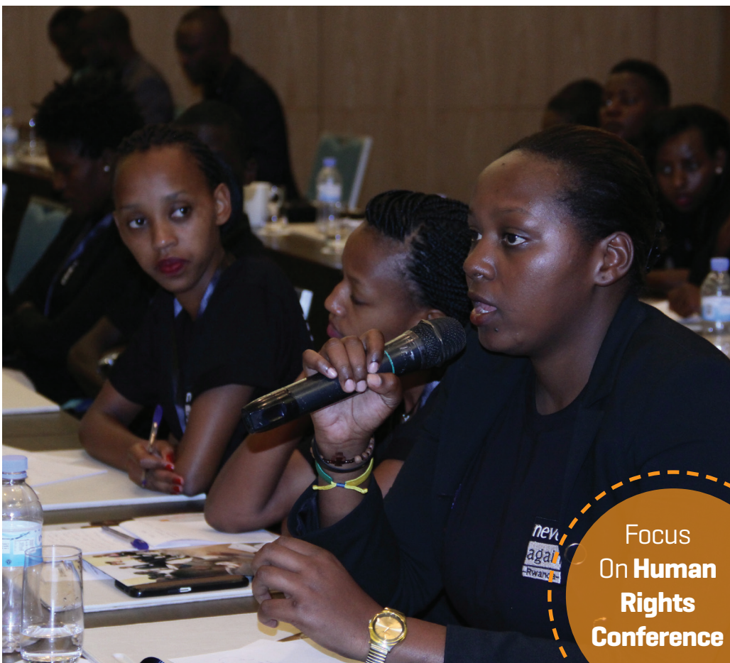
DISCUSSING HUMAN RIGHTS: one of the youth sharing their view on Human Rights in Rwanda